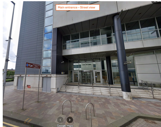
External view - Main entrance