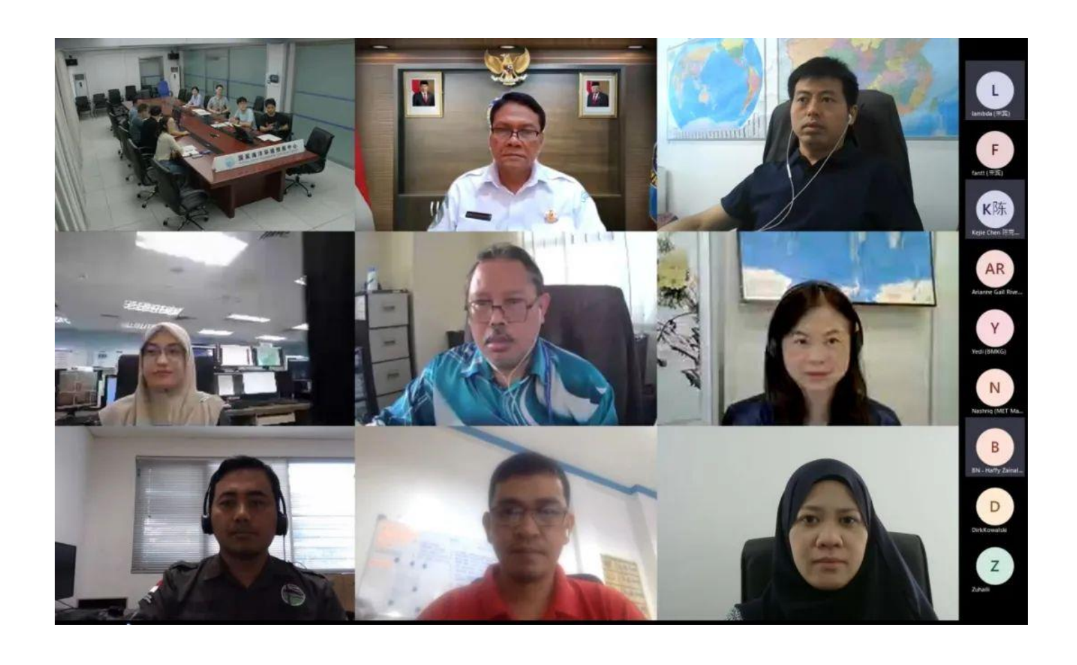
First NMEFC-BMKG Workshop on Non-seismic Tsunamis and Complex Tsunamis, 14 July 2022 [Online]

Attended by over 200 participants from Brunei Darussalam, China, Indonesia, The Philippines and Singapore, as well as Japan, Tonga and United States.