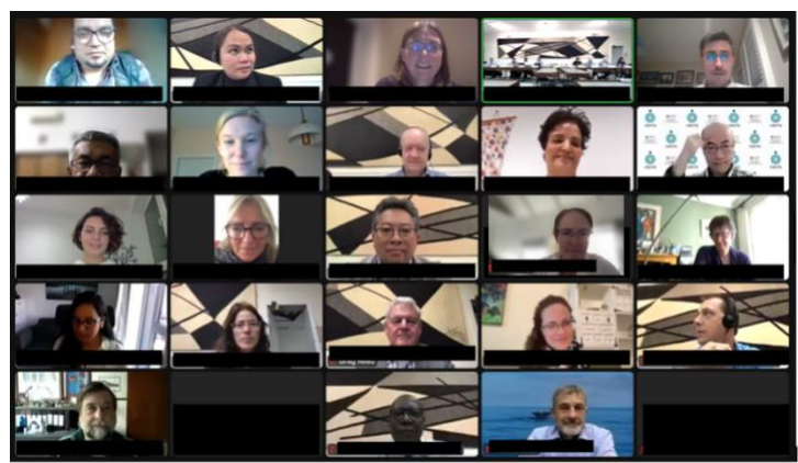
Some of the participants via zoom