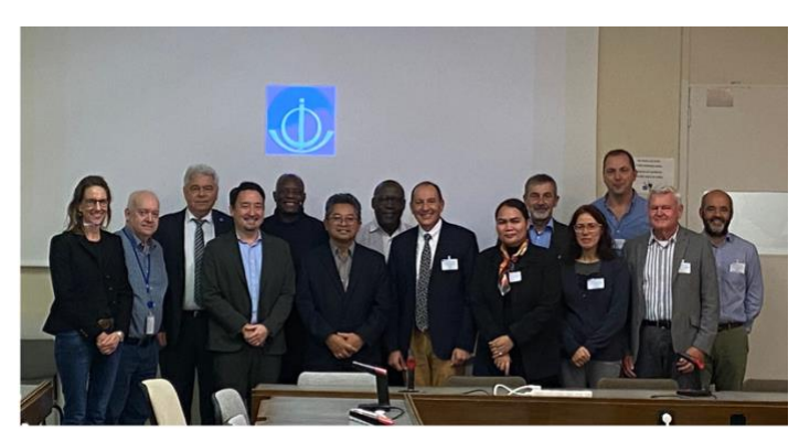
Onsite participants at UNESCO HQ in Paris